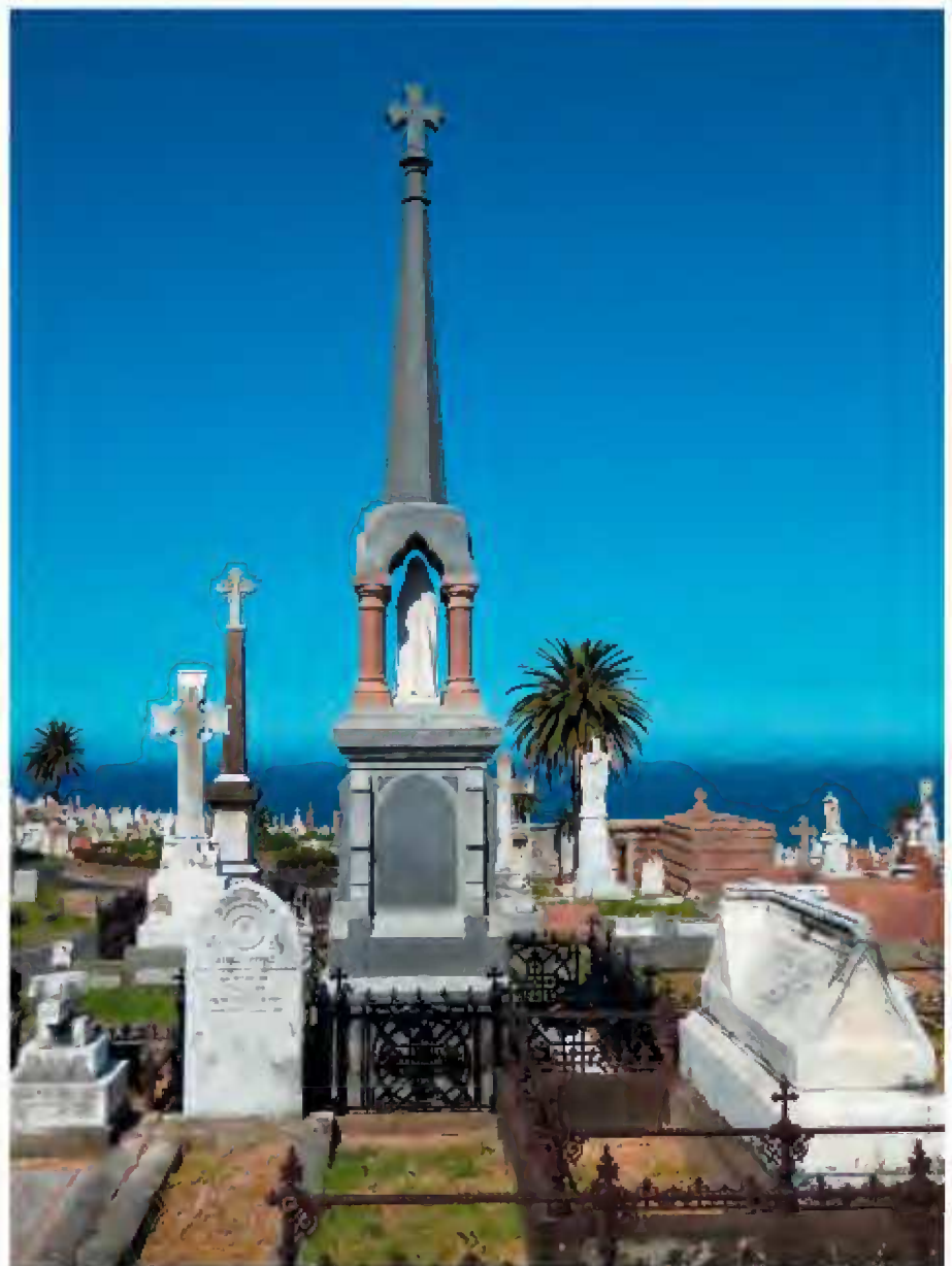
Fig. 1. Memorial to Tenison Woods, Waverley Cemetery, Sydney.

Tenison Woods received well-deserved recognition in his lifetime. In the year before he died he was awarded the 1888 Clarke Medal of the Royal Society of New South Wales for his natural history